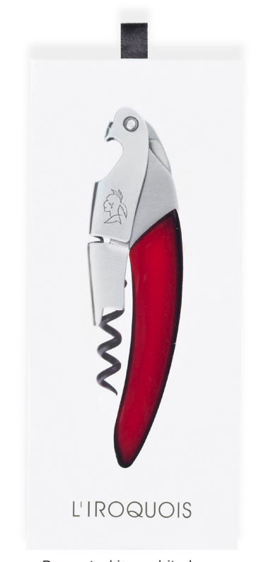
Presented in a white box.